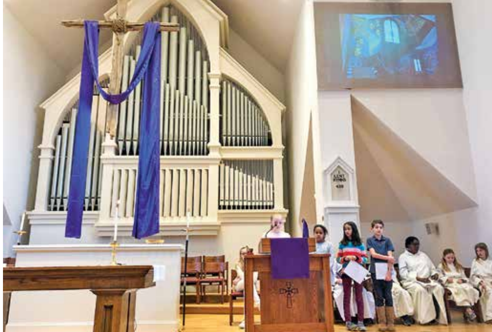
Grade 5 students share reflections during a student-led Chapel in the Nave, a new initiative started this year to promote leadership and presentation skills.