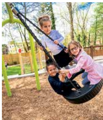
On the cover: Nursery School students get into the swing of things on the redeveloped Primary Grades Playground.