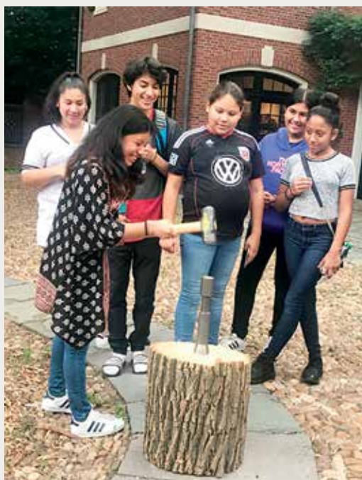
Horizons Greater Washington students strike their own Byzantine coins at Dumbarton Oaks.