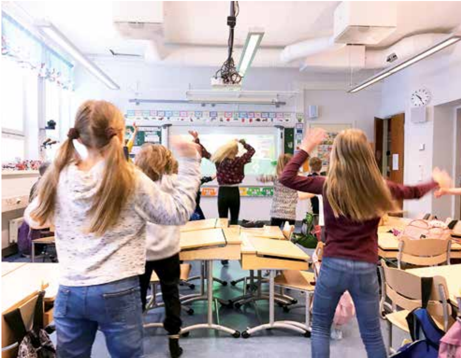
Grade 2 children (ages 8–9) take a movement break while others wash their hands for lunch.

CHRIS HEIM'S travel to Finland to learn about their schools was supported by Day School professional development funds.