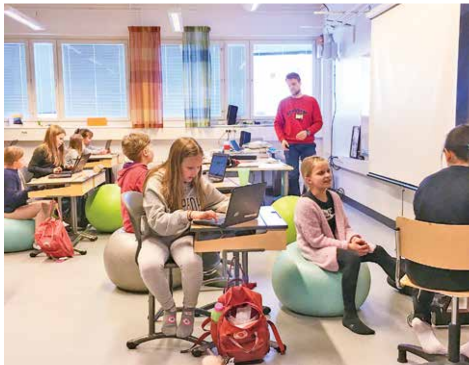
Grade 4 students (ages 10–11) at a Finnish comprehensive school (Grades 1–9) research the necessary elements for growing lettuce while enjoying flexible seating options and wearing only socks on their feet (to keep the snow out of the classrooms).