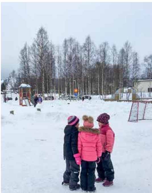
It is not uncommon to spot a hockey net on Finnish school playgrounds. At the primary level, each 45 minutes of instruction is followed by 15 minutes of recess.

“The respect for child development [in Finland] and, in particular, children’s need to play and move their bodies as part of the learning process, is a reminder that teachers everywhere will get the most from their students if they put children’s needs first.”