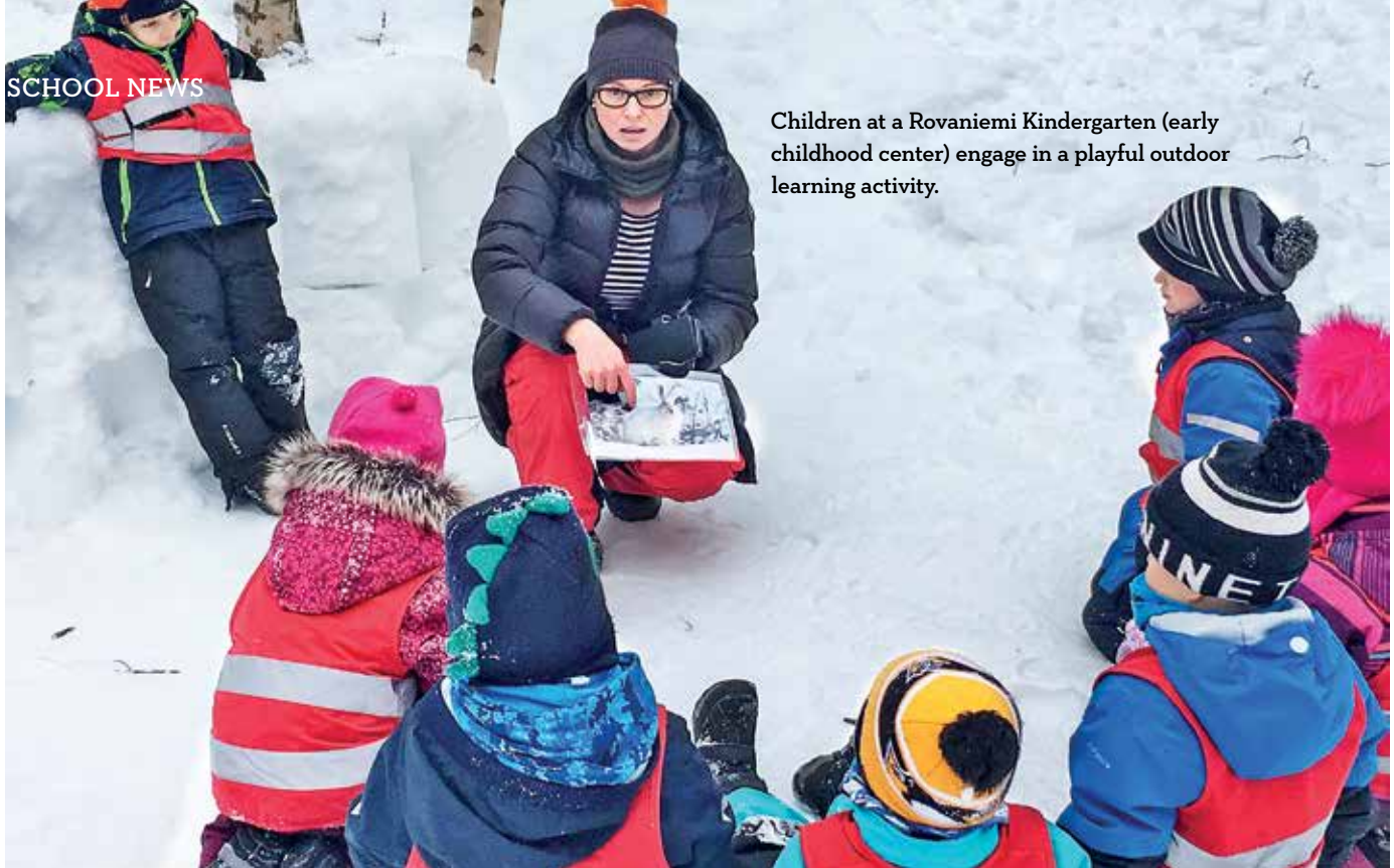
Children at a Rovaniemi Kindergarten (early childhood center) engage in a playful outdoor learning activity.