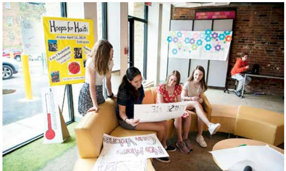
Grade 7 students create signs to use for the student-led walkout to end gun violence.

In their final Advisory sessions at the end of the school year, Grade 8 students, encouraged throughout their middle school years inside and outside of their