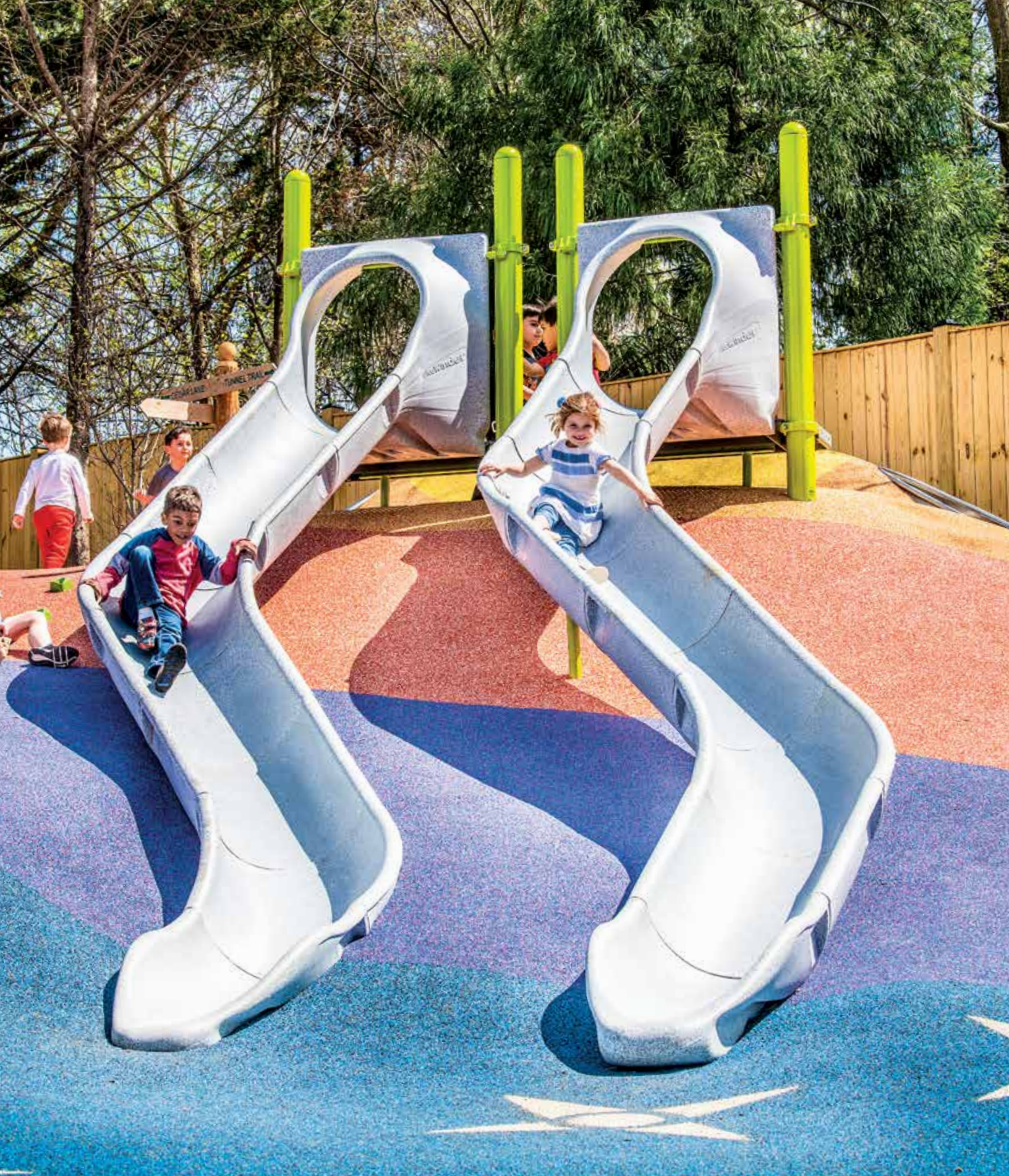
Nursery Schoolers excitedly race down the slides during recess.